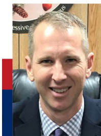
Wallace Town Mayor Jason Wells